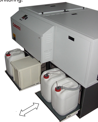
COLENTA ILP 68 LS / OL